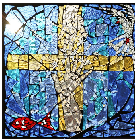
Stained glass in the original Titoki chapel

We are now praying for a new team member with a heart for hospitality (ideally live-in) to run the kitchen and cook great food.