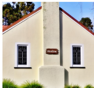
Shalom House, Titoki