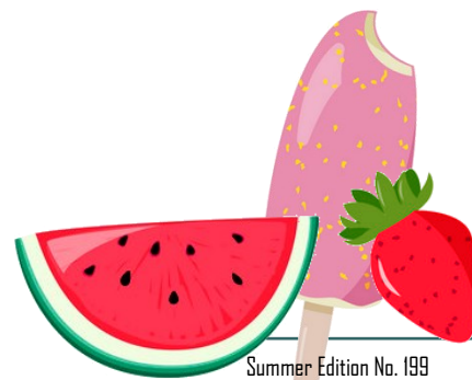
Summer Edition No. 199